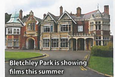
Bletchley Park is showing films this summer

An exhibition showcasing the finest examples of medieval embroidery the country has to offer. From 1 October at The Victoria And Albert Museum, London SW7: 020-7942 2000, www.vam.ac.uk